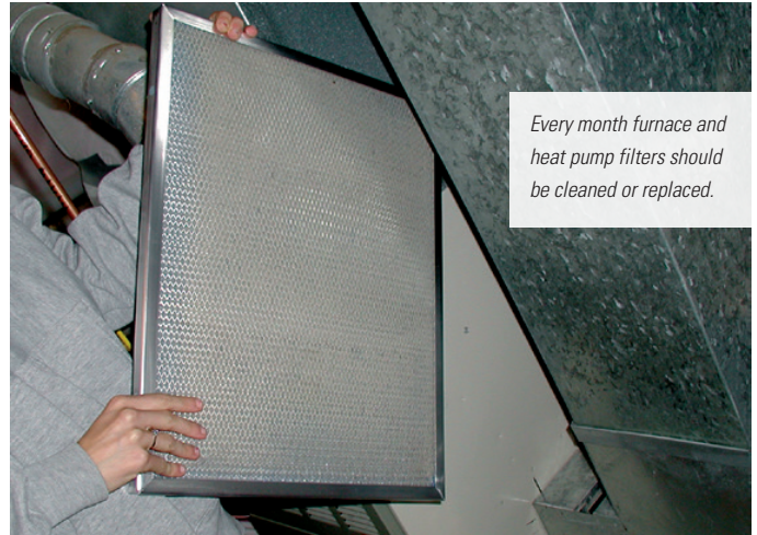
Every month furnace and heat pump filters should be cleaned or replaced.

Note: Consult owner's manual prior to performing any maintenance on equipment.