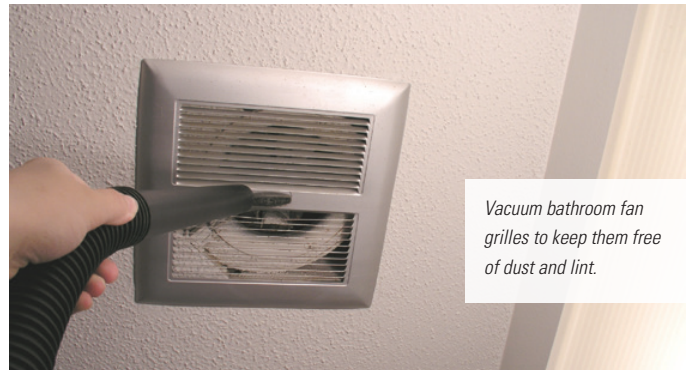
Vacuum bathroom fan grilles to keep them free of dust and lint.