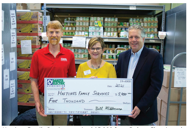
Hastings Family Services received $5,000 from Dakota Electric and CoBank.