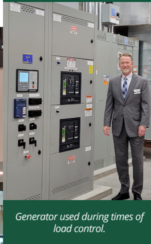
Generator used during times of load control.