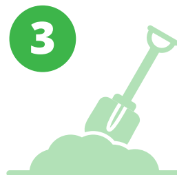
3 Contractor dig-ins