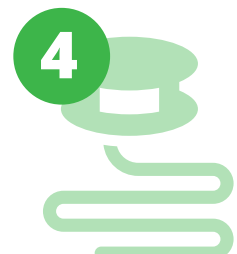
4 Cable failures