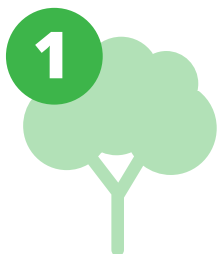
1 Trees / vegetation

Not all outages are caused by severe weather. Take a look at the most common reasons power interruptions occur across Dakota Electric's system.